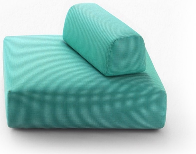
Seat: B77A_BT313728 Backrest: B77E_BT313728